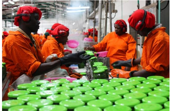
Jarring section at the Frigoken plant.

Frigoken is a part of the Agro and Food Processing sector of IPS, which is the industrial and infrastructure development arm of the Aga Khan Development Network (AKDN)- a group of private, international, non-denominational development organization that works towards improving the welfare and prospects of people living in the developing world.