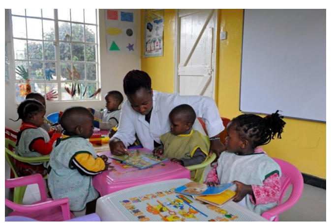
The crèche facility is run by trained ECD staff.

Principle 2: Make sure that they are not complicit in human rights abuses.