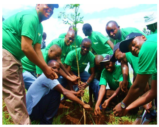
Frigoken staff plant trees in effort to rehabilitate Muvaa river

Principle 9: Business should encourage the development and discussion of environmentally friendly technologies.